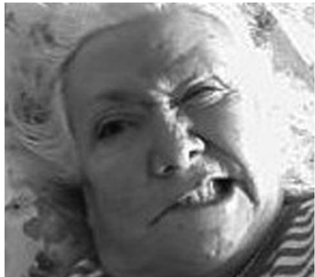
Figure 4. House-Brackmann grade VI facial paralysis