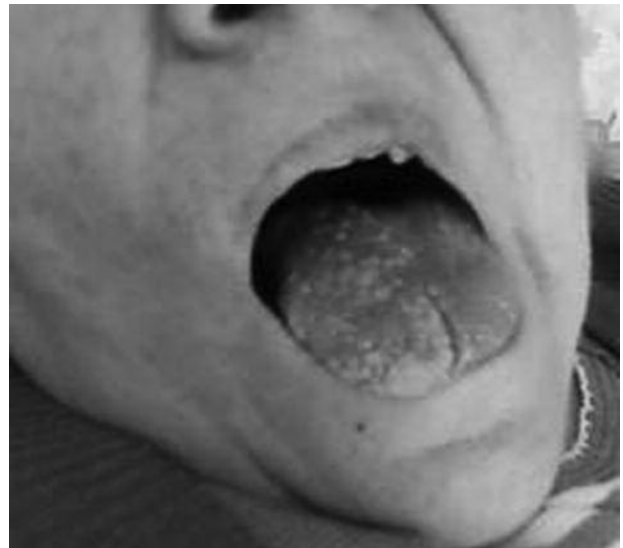
Figure 2. Vesicles on the right side of 2/3 of anterior tongue