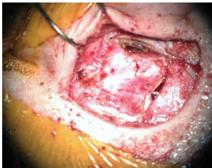
Figure 5. Periosteum was easily repositioned with only two sutures in the corners of periosteal flaps