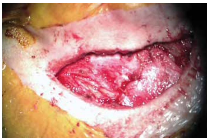
Figure 6. Complete periosteal covering after suturing of the periosteal flaps

The follow-up period ranged from six months to one year. No complications were seen during or after the surgeries. There was no evidence of device migration, wound infection, wound hematoma, or delayed wound healing. The mastoid emissary vein was intact in all cases.