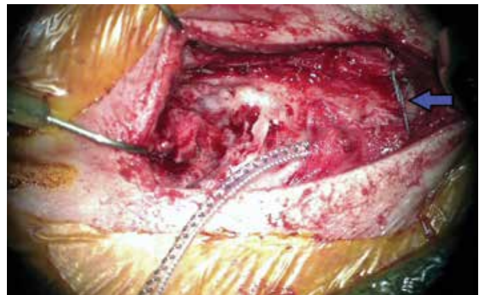
Figure 4. Tie-down suture (blue arrow)

dust, hemostasis is obtained, and the receiver/stimulator is placed in its seat in the subperiosteal pocket. The inferior-based periosteal flap is placed over the device and sutured with 2/0 ticon suture (non-absorbable braided nylon suture) (Figure 4). This suture should connect the inferior and superior sides of the curving periosteal incision, and it should be tightly secured to hold the device in place, preventing anterior migration.