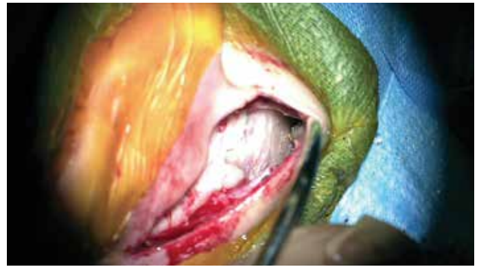
Figure 3. The subperiosteal well created in the subperiosteal pocket for the receiver/stimulator

Mastoidectomy, posterior tympanotomy, and cochleostomy are typically performed. Additionally, a groove is drilled for the electrode lead wires connecting the receiver/stimulator seat to the mastoidectomy cavity. The whole field is then irrigated free of all blood and bone