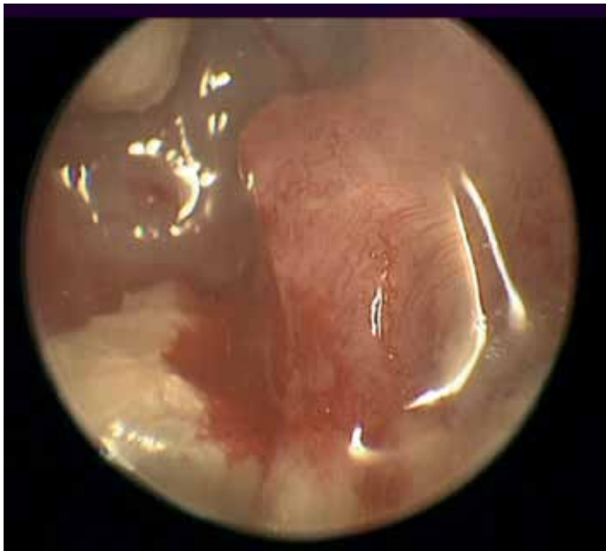
Figure 2. Intraoperative photograph following debulking of polyp under general anesthesia displaying large underlying cholesteatoma