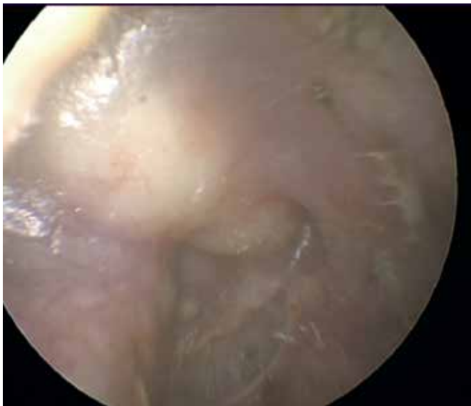
Figure 3. Evidence of multiple foci of cholesteatoma affecting neotympanum of patient with previous canal wall down procedure (intraoperative photograph)