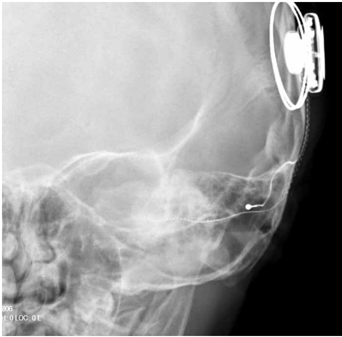
Figure 3. X-ray graph of the patient in whom the electrode does not rotate along the cochlea.

Furthermore, intraoperative difficulties, including the poor visualization of anatomical landmarks or limited access, may increase the surgeon's suspicion of incorrect placement. Thus, a combination of intraoperative electrophysiological tests and radiological imaging are used to confirm proper electrode placement, although no standard procedure has yet been accepted.