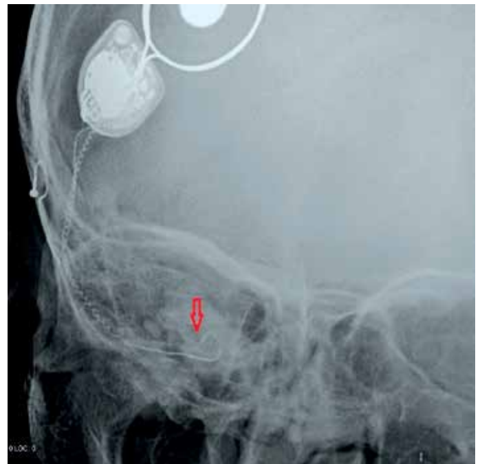
Figure 2. Red arrow indicates tip rollover of electrode array, which does not require immediate revision surgery.

The surgeons suspected an inappropriate position of the electrode array in four patients. In three of these patients, the X-ray showed the partial insertion as a 0.5 turn of the electrode array. The postoperative plain X-ray showed complete and proper insertion in only one suspected case. The positive and negative predictive values of surgical suspicion in electrode placement were 75% and 99.1%, respec-