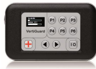
Figure 1. Picture of the VertiGuard®-device and the wearing position during testing. The numbers on the device are for selecting training tasks during vibrotactile feedback training. This function was not relevant and thus not enabled during the present study.

performed to enable easier comparison between the effects on different sensorimotor conditions.