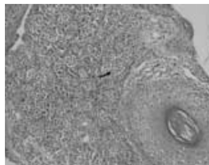
Figure 3. The cells with scant cytoplasm and uniform nuclei in nevic nests (Arrow). (H&E X20)

subgroups according to histological location, namely, junctional, compound, and intradermal [7] . Junctional nevus cells are situated at the epidermo-dermal junction and extend into the dermis, but they always remain in contact with the epidermis. Characteristically, intradermal nevus cells are restricted to within the dermis and do not contact the epidermis. The compound nevus represents the transitional stage between the junctional and intradermal nevus, and exhibits features of both these forms [7] . Clinically, five types of melanocytic nevi can be recognized: flat lesions, slightly elevated lesions often with raised centers and flat peripheries, papillomatous lesions, dome-shaped lesions and pedunculated lesions [5] . Most papillomatous lesions, as in the present case, and nearly all dome-shaped and pedunculated lesions represent intradermal nevi [8] .