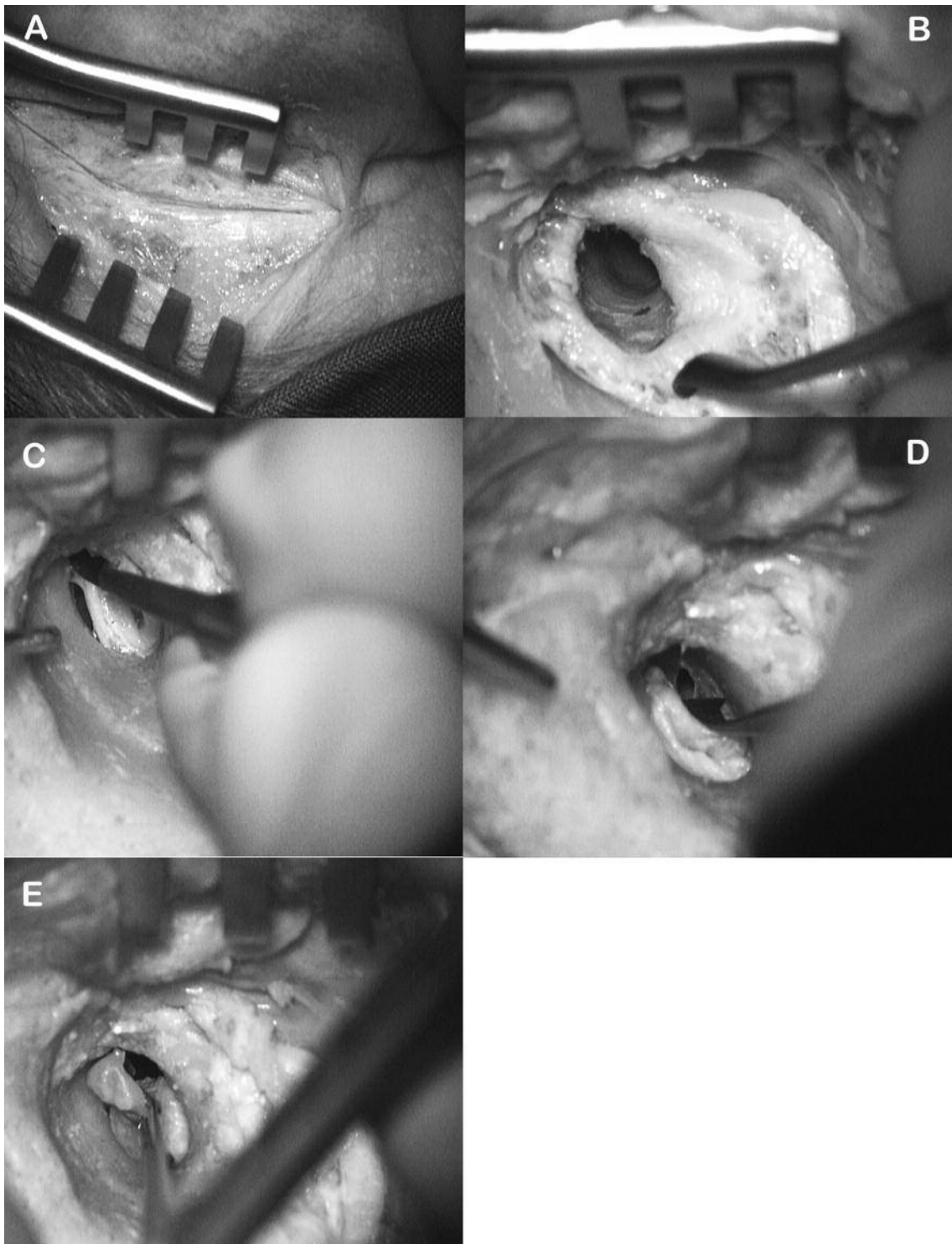
Figure 1. Graft procurement.

A , a retroauricular skin incision is used. B , the external auditory canal skin is incised circumferentially with a scalpel or Berckmans decollator to define the bony canal. C-D , the external auditory canal cuff is released circumferentially from the bony canal approaching the bony annulus by using a Marquet decollator or a small Rosen knife. E , the malleus neck can be mobilised with a bent or straight microforceps to remove and procure the entire tympano-malleal allograft.