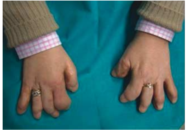
Figure 2: Patient's hands after multiple operations.

Her fingers were congenitally fused; they regained a cosmetically acceptable look and a satisfactory motile function after repeated surgical interventions (Figure 2).