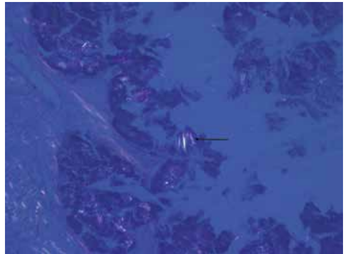
Figure 3. Negatively birefringent MSU crystals by polarized light microscopy. HE staining ×400 (black arrow)

derwent intact canal mastoidectomy under general anesthesia, and middle ear sclerosis was determined as Wieling Kerr classification type 2. White tympanosclerotic plaques were cleared from the incus and stapes, and hearing reconstruction was performed with a titanium partial ossicular reconstruction prosthesis (KURZ®; Dusslingen, Germany). A postoperative histopathologic examination of the specimen (Figure 2, 3) revealed amorphous eosinophilic deposits within the fibrous stroma and tophi containing negatively birefringent MSU crystals by polarized light (Figure 2, 3). After the histopathologic diagnosis of gout, the patient was assessed for peripheral joint involvement. He had no radiographic abnormalities such as erosions, cystic