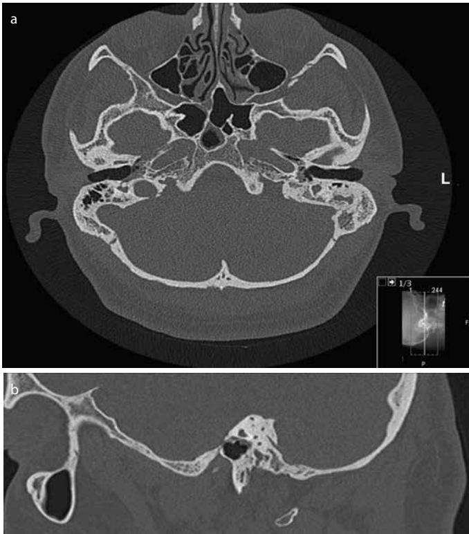
Figure 1. a, b. Temporal bone computerized tomography. Soft tissue density of the left middle ear and non-specific mastoiditis. Axial cross-section image (a), sagittal cross-section image (b)