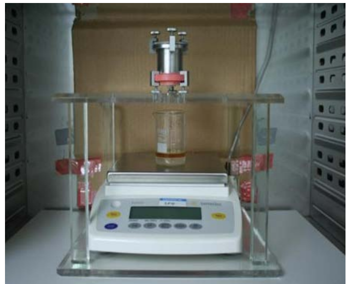
Figure 2. Testing environment: climatic chamber containing a Perspex table with a balance and a beaker. The sealed Paddington cup was suspended and inverted above the beaker through a hole in the table

The 24-hour temperature and humidity of the incubator was monitored for the duration of testing using a Tinytag data logger (Gemini Data Loggers Ltd., Chichester, UK), and the balance was subjected to precision checks using 1 g, 10 g, and 500 g laboratory check-weights. Additionally, the incubator fan was baffled using a cardboard screen to minimize unwanted airflow that might cause fluctuations in the balance readings. In turn, 720 balance readings were collected at