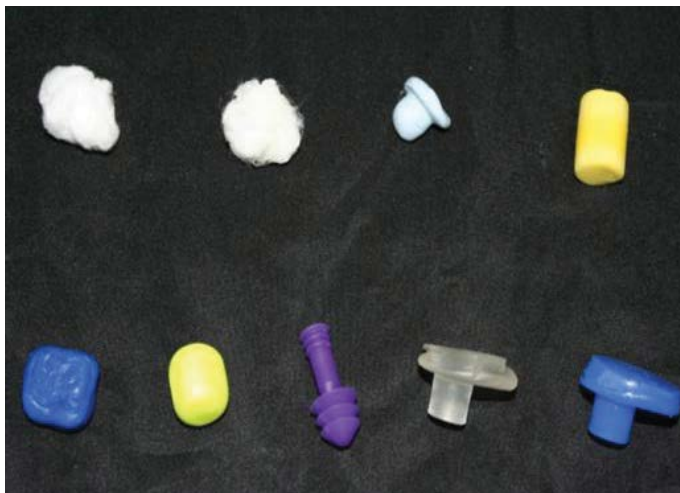
Figure 1. Test materials (from top left to right): Cotton wool mixed with petroleum jelly (a); cotton wool externally coated with petroleum jelly (b); Blu-Tack; PVC foam earplugs; Mack's silicone putty; "Soggy Froggy" silicone earplug; Mack's AquaBlock flanged earplug; hard silicone custom mould; soft silicone custom mould