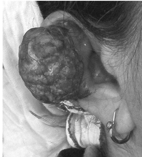
Figure-1: The clinical presentation of a multilobulated necrotic mass at the helix of the right auricula.

A 45-year-old female patient presented with an enlarging malodorous mass on her right auricula. Physical examination revealed a round, lobulated, necrotic, infected mass approximately 5 x 5 x 3 cm in diameter on the auricula from the helix to antitragus (Figure 1). The results of an otoscopic examination and audiologic tests were within normal limits, and no pathologic conditions were noted. Oropharyngeal findings were unremarkable, and the patient exhibited neither cranial nerve deficits nor lymphadenopathy.